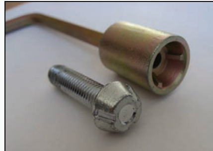
Tamper-resistant Bolt with matching wrench