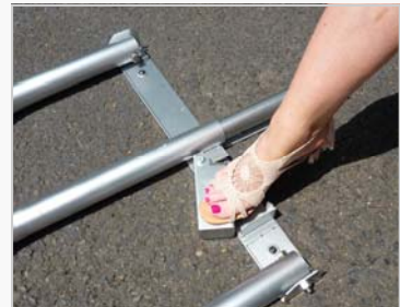
The barrier is released from its locked down position by foot

MySpot 30 is constructed using high grade, heavy duty durable steel tubing. All parts are treated with rust protection and are powder coated with outdoor paint. The mounting bases are constructed of 3mm steel, with 14mm hinges for extra strength. (5) M8 bolts anchor the unit to the ground for resistance to car abuse. Optional kits provide special security bolts along with a suitable wrench to remove these bolts. Other kits provide mounting hardware for asphalt.