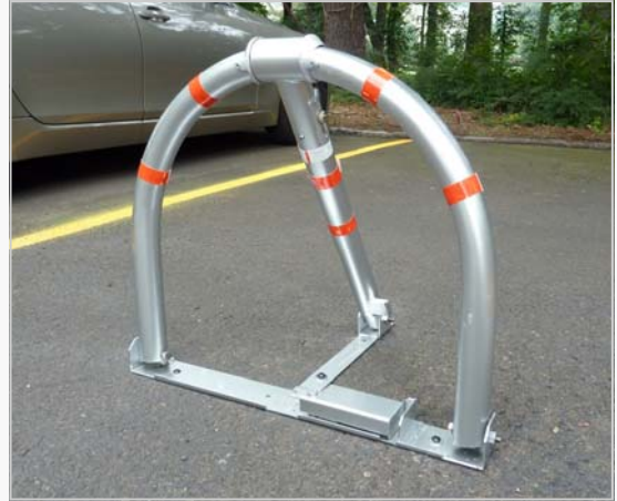
MySpot 30 guards individual parking spaces

To raise the barrier after the car leaves, the user steps on a pedal. This releases the barrier from its ground lock, and it rises on its own power to the vertical position where it self-locks. Once locked in the vertical position, the user needs a key to release the lock. The pedal is designed so that a car tire will not accidentally release the barrier.